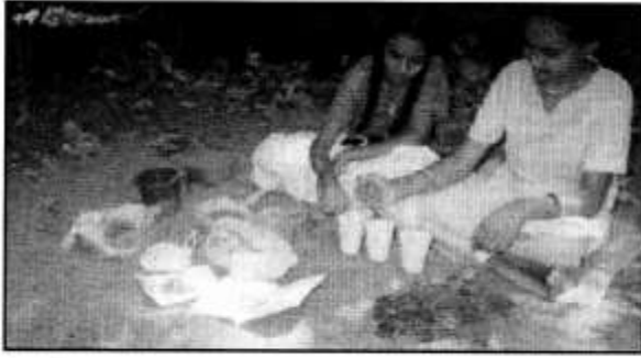
► Fig. 1.2a Preparation of the experiment

to 10 days observe their growth [Fig. 1.2(b)].